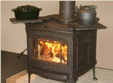
Concealed swing-out Cook Top means warm meals in wild winter weather.