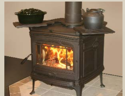
Concealed swing-out Cook Top means warm meals in wild winter weather.

The radiant heat of cast iron, the convective warmth of steel design is conveniently sized in the T4 for spaces up to 1500 sq. ft.